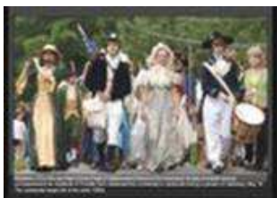
Franklin Area Centennial Stamp

As a memento of the centennial, you may wish to purchase a supply of the beautiful Franklin Area Centennial stamps, illustrated below, which have been created by Dwight Marsh. They can be seen and purchased on our website at www.franklinarea.org .